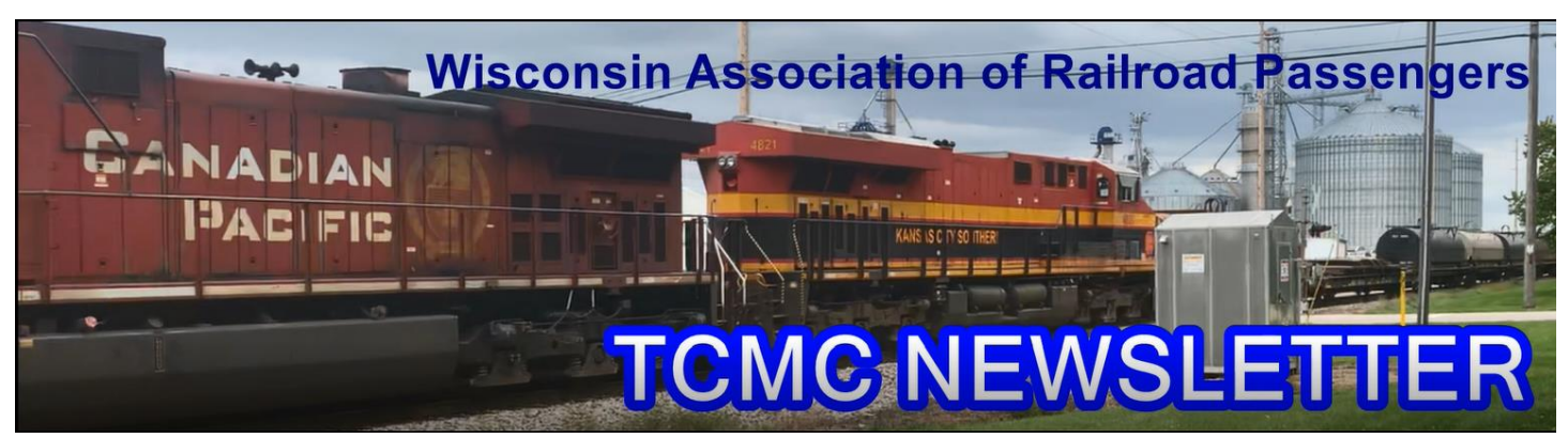
Volume 4, Number 4